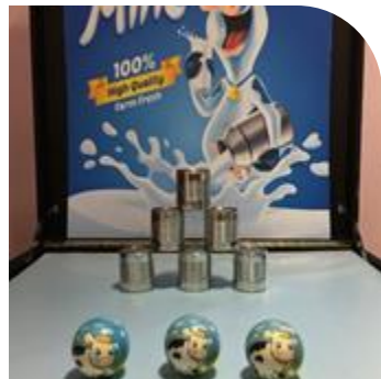
MILK TIN TOSS