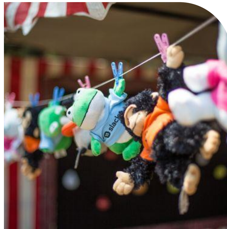
PLUSHIES BOOTH TO REDEEM!

*Images are for illustration purposes only. Prices stated are subject to change and dependent on the availability of venues and service providers.