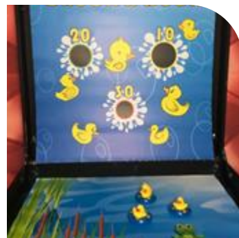
CHUCK A DUCK