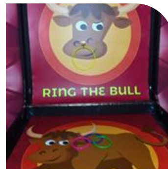
RING THE BULL